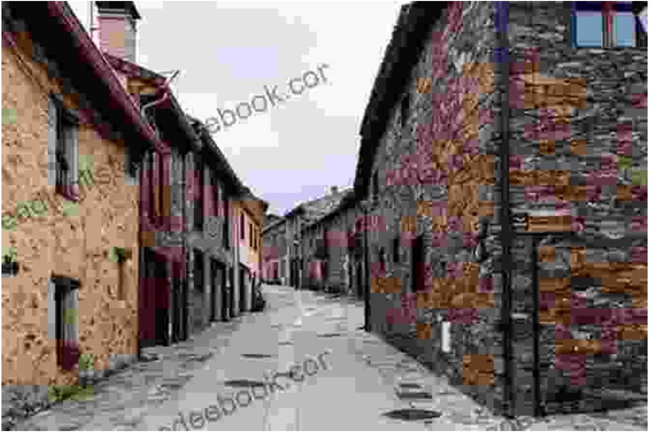
Quaint streets lined with traditional stone houses and vibrant flowers create a charming atmosphere in Estamariu.