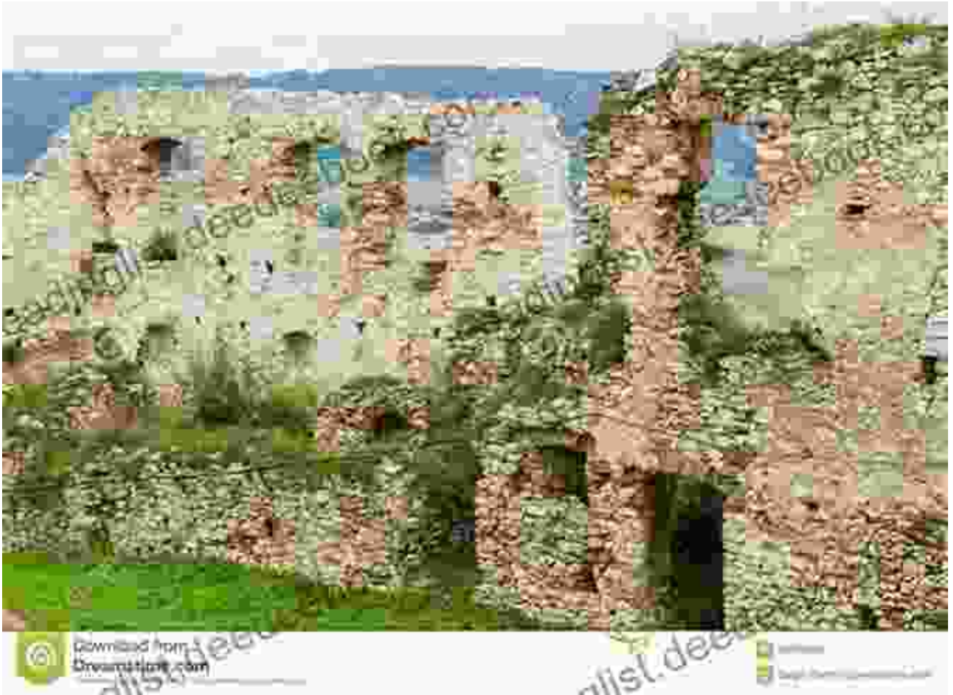
The ruins of a medieval castle stand as a testament to Estamariu's rich history.